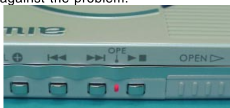
Main unit OPE LED

The models concerned may produce low-level noises with volume at minimum position. The noises occur in synchronization with blinks of OPE LED, approximately 8 seconds after starting playback operation. Take the following action against the problem.